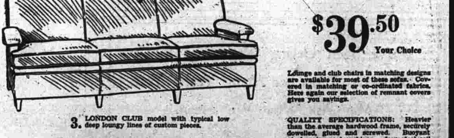
3. LONDON CLUB model with typical low, deep lounge lines of custom piece.